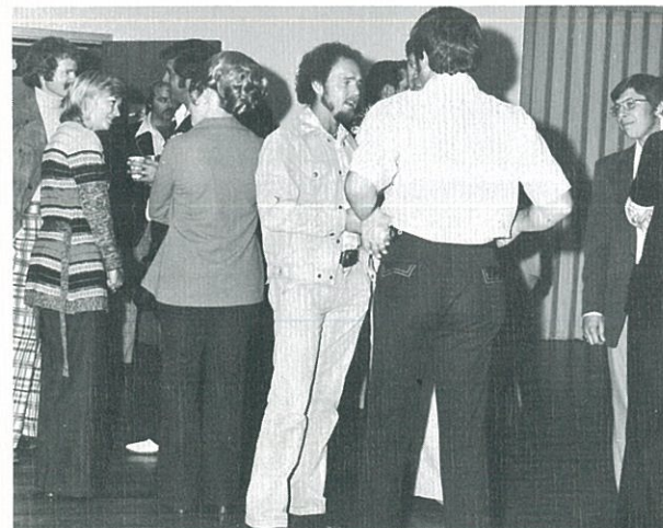
Exes enjoy reunion.