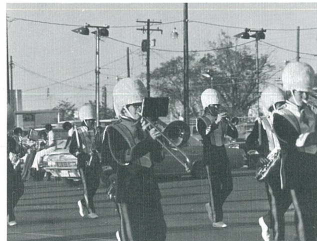
"K" Band performs in parade.