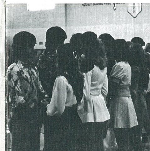
Pinning of colors.